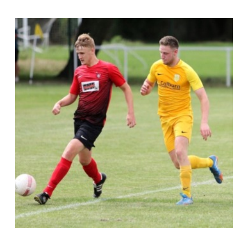
UPPER BEEDING FC

Pre Season preparations are completed and the football season is underway. Our 1sts commenced their campaign away at Worthing Town FC in Macron SCFL Div 2 on Sat 17 August and following their appearance in the Sussex Intermediate Cup Final last April are hopeful for a good season.